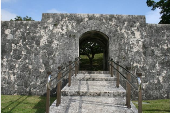
Arched Gate in the Castle Walls