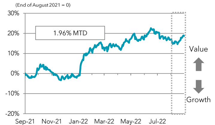
Figure 3. Value-Growth Spread

The spread between the Russell/Nomura Value Index and the Growth Index (Positive figure means value dominant)