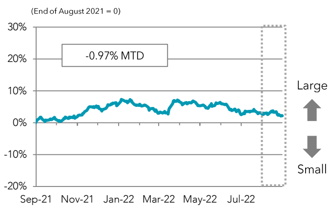
Figure 4. Large-Small Cap Spread

The spread between the Russell/Nomura Large Cap Index and the Small Cap Index (Positive figure means Large Cap dominant)