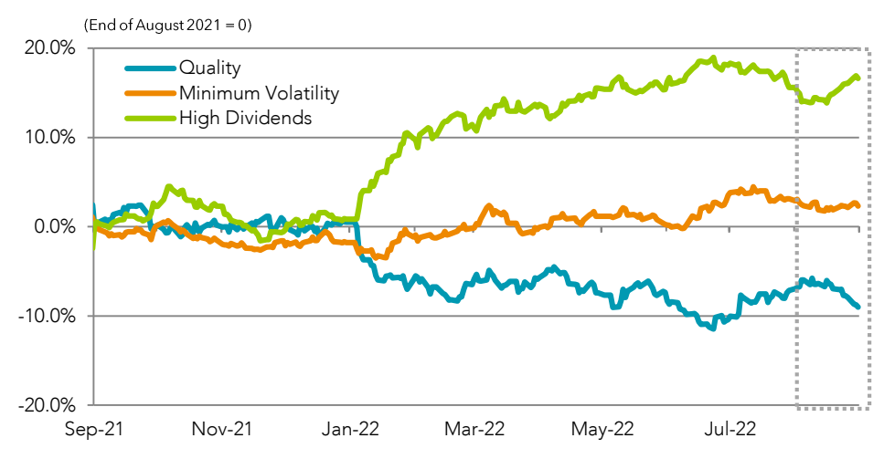
Figure 5. MSCI Japan Factor Indexes Spread against MSCI Japan

Data: Bloomberg, Nomura, SuMi TRUST (as at the end of August 2022)