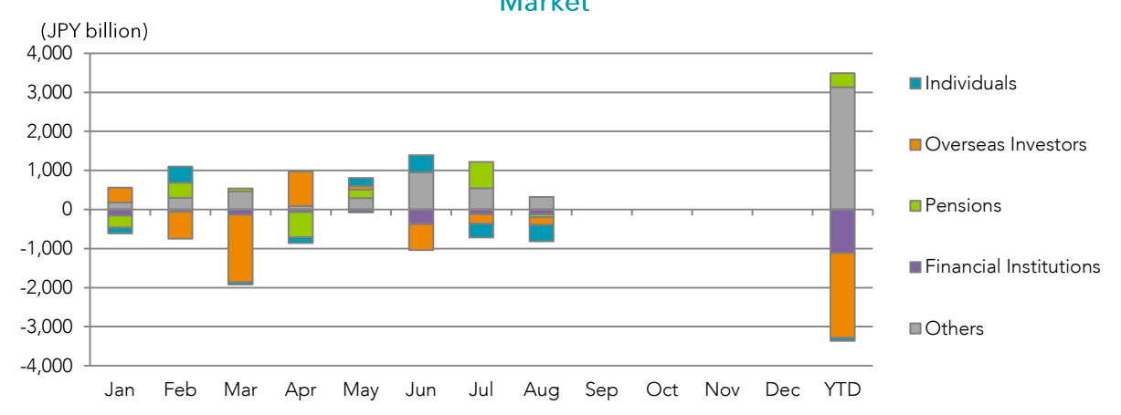
Figure 6. Monthly Investment Activities by Investor Type in the Japanese Equity Market

Data: Bloomberg, SuMi TRUST (as of 19th August 2022)