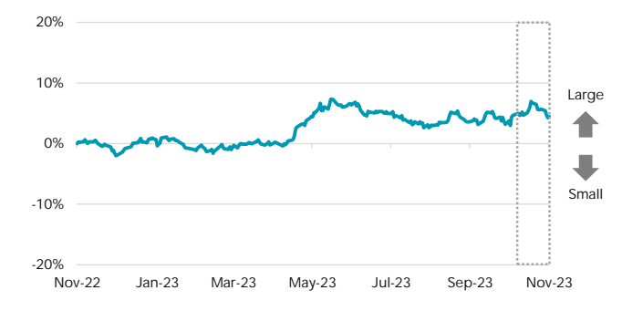
FIGURE 4. LARGE-SMALL CAP SPREAD

Note: The spread between the Russell/Nomura Large Cap Index and the Small Cap Index (Positive figure means Large Cap dominant)