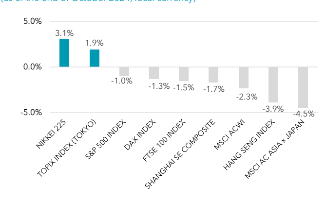
FIGURE 2. GLOBAL EQUITY MARKET MONTHLY PERFORMANCE (as of the end of October 2024, local currency)