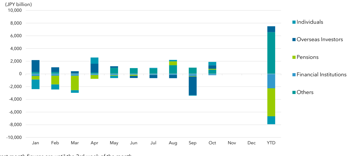
FIGURE 6. MONTHLY INVESTMENT ACTIVITIES BY INVESTOR TYPE IN THE JAPANESE EQUITY MARKET**

*The measurement begins from the end of September 2023, starting from 0%.