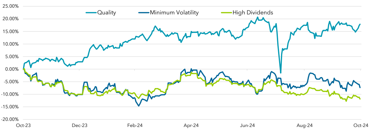
FIGURE 5. MSCI JAPAN FACTOR INDEXES SPREAD AGAINST MSCI JAPAN*

Note: The spread between the Russell/Nomura Large Cap Index and the Small Cap Index (Positive figure means Large Cap dominant)