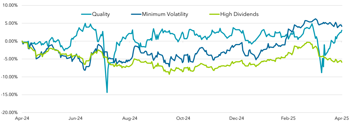
FIGURE 5. MSCI JAPAN FACTOR INDEXES SPREAD AGAINST MSCI JAPAN*

Note: The spread between the Russell/Nomura Large Cap Index and the Small Cap Index (Positive figure means Large Cap dominant)