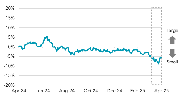
FIGURE 4. LARGE-SMALL CAP SPREAD

Note: The spread between the Russell/Nomura Large Cap Index and the Small Cap Index (Positive figure means Large Cap dominant)