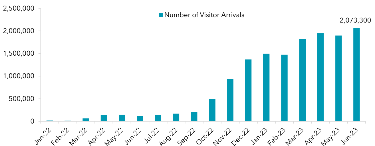
Number of Visitor Arrivals between January 2022 and June 2023

Source: JNTO (as of the end of June 2023)